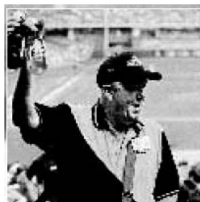
SABMillers in US sport

In 2003 it was the largest foreign brewer in China, and has also has operations in 7 other Asian countries. In May 2005, it doubled its stake in India, where it is now the No.2 brewer with 10 breweries. In October 2005, it bought a controlling share of Bavaria, No.2 brewer in South America. It is the No. 1 brewer in Africa, operating in 20 countries. In Africa it also produces soft drinks, including CocaCola (switching from Pepsi a few years ago) and maintains its own bottling capacity.