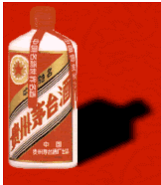
Moutai produced in B.C 135