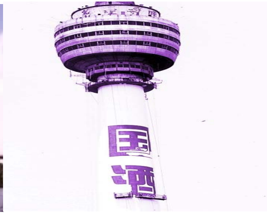
Wuhan TV tower (5th high in the Asia) Alcohol ad is panting on Wuhan TV tower