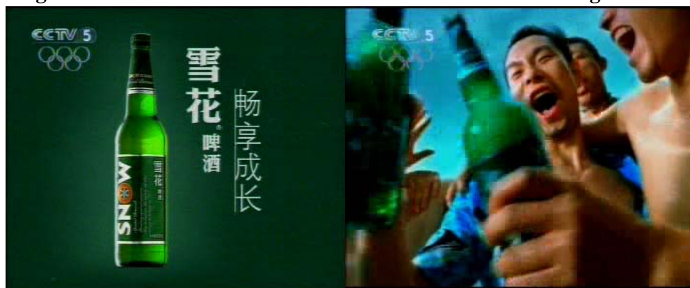
Fig2. Alcohol advertisements on Channel 5 of CCTV at Aug 2004

Chinese young people drink famous Snow Beer to celebrate the win in Olympic Game