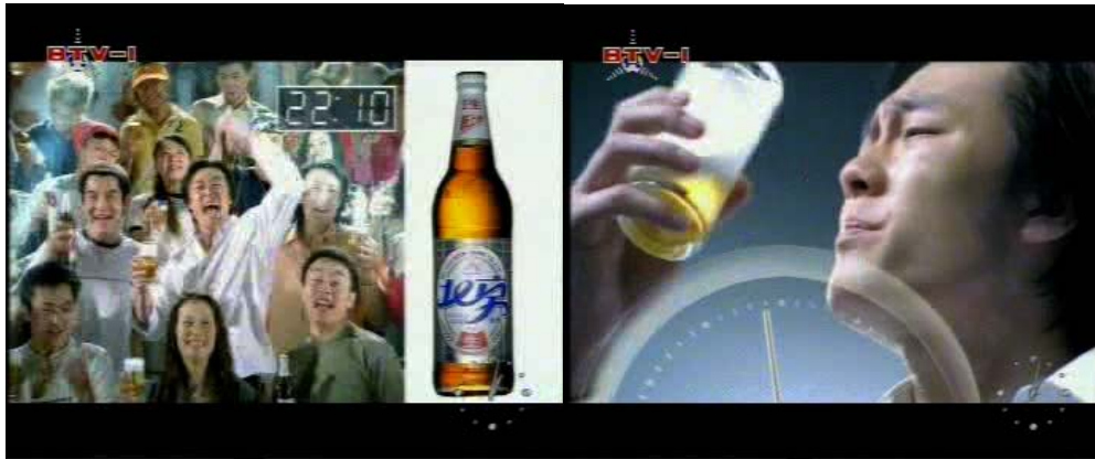
Fig3. Alcohol advertisements on Channel 1 of Beijing TV at Sept 2004

Chinese young people drink Beijing Beer to celebrate the win in Olympic Game