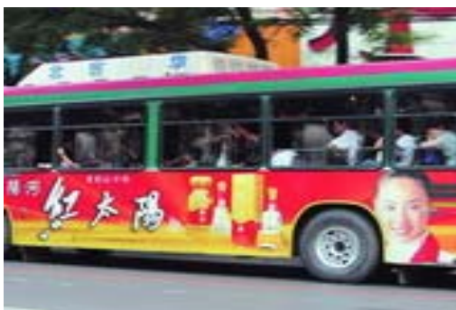
Fig5. Alcohol advertisements displaying on the public place

The following alcohol advertisements were displayed on public places in 2004.