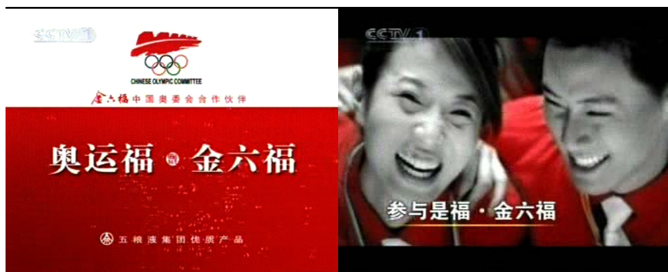
Fig1. Alcohol advertisements on Channel 1 of CCTV at Aug 2004

Sponsor of Chinese Olympic Committee ----- “Jinliufu” is luck spirits