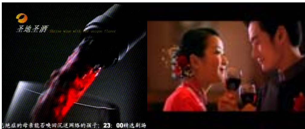
Fig4. Alcohol advertisements on Hunan TV at Aug 2004

Chinese wine " Shangre-La-Zangmi " bring loves and felicities